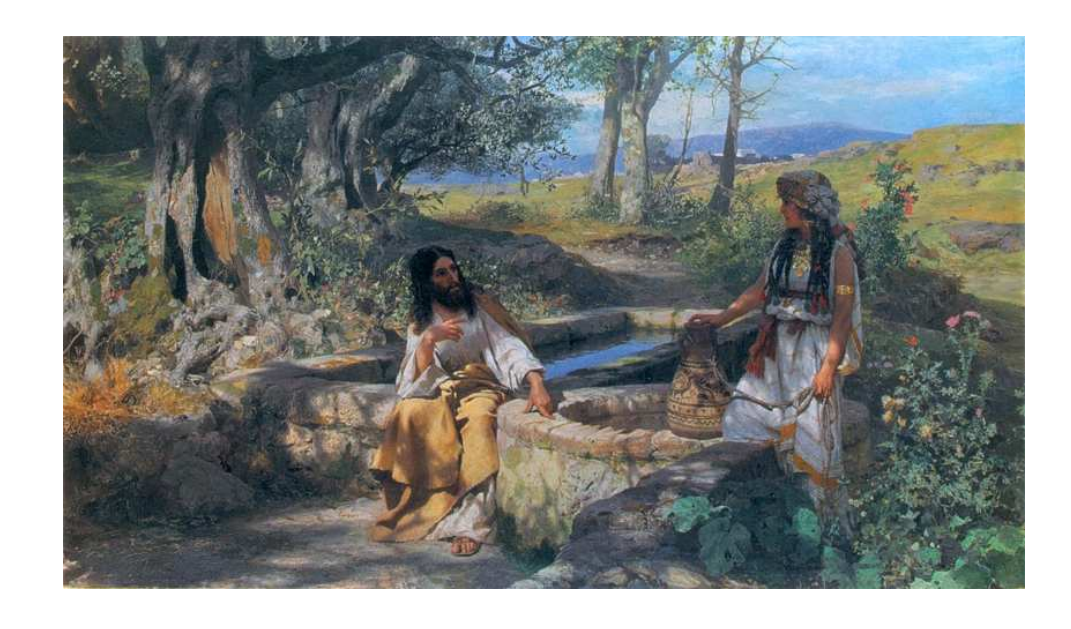
Shaped through thirst

Attribution: Siemiradzki, Henryk, 1843-1902. Christ and the Samaritan Woman, from Art in the Christian Tradition , a project of the Vanderbilt Divinity Library, Nashville, TN. https://diglib.library.vanderbilt.edu/act-imagelink.pl? RC=54747 [retrieved March 11, 2023]. Original source: http://commons.wikimedia.org/wiki/File:Siemiradzki-Chrystus_i_Samarytanka.jpg.