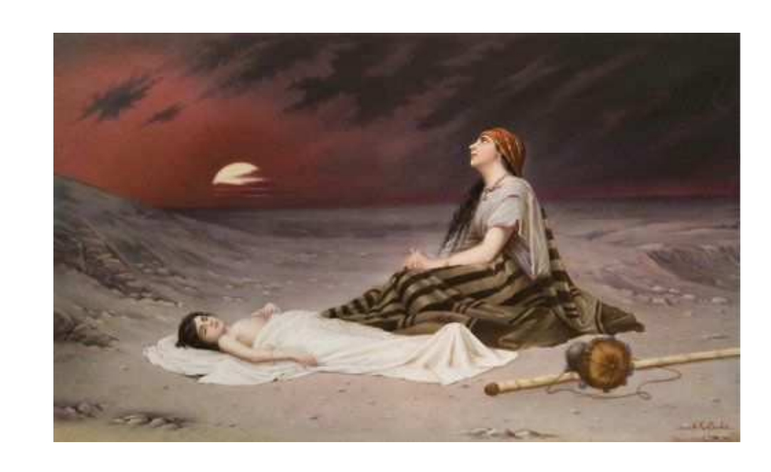
Water in the desert