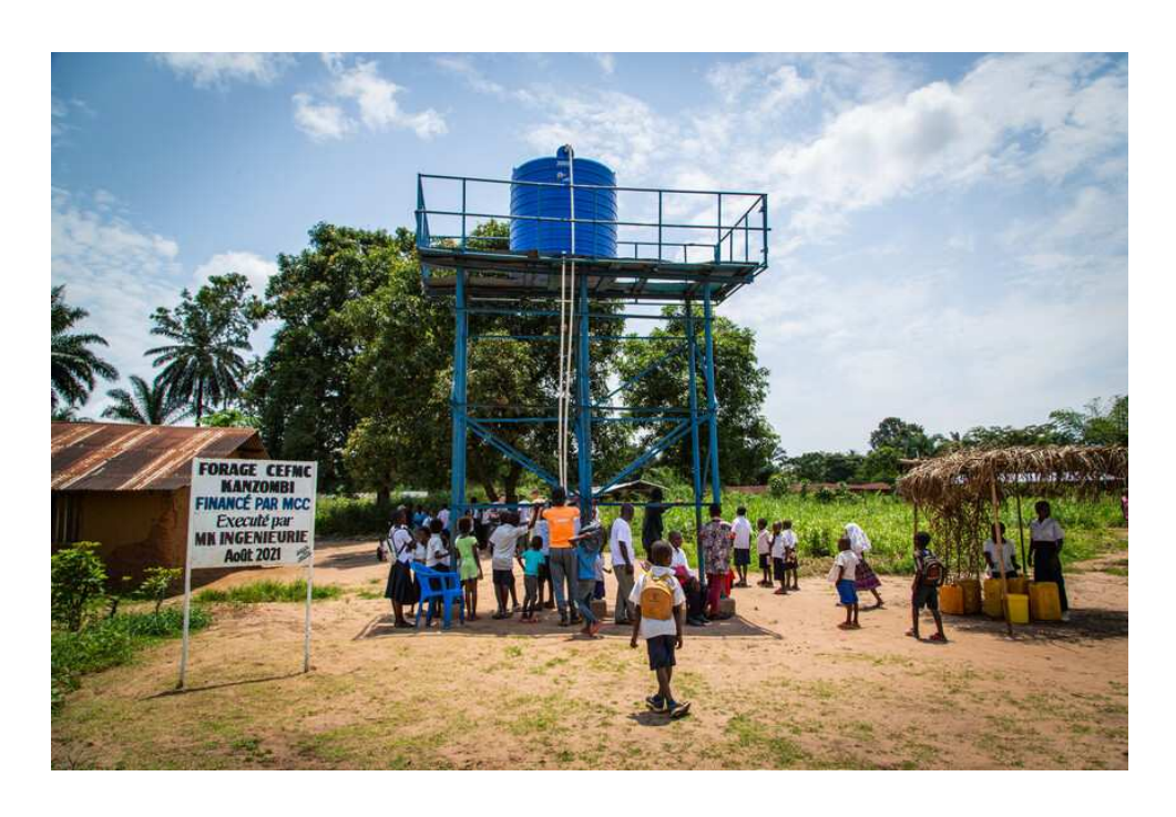
The great banquet

UN Sustainable Development Goal #2 pledges to "End hunger, achieve food security and improved nutrition and promote sustainable agriculture." This goal has been made even more challenging to meet given the global COVID-19 pandemic and its aftershocks, climate change, escalating violent conflicts and growing inequalities.