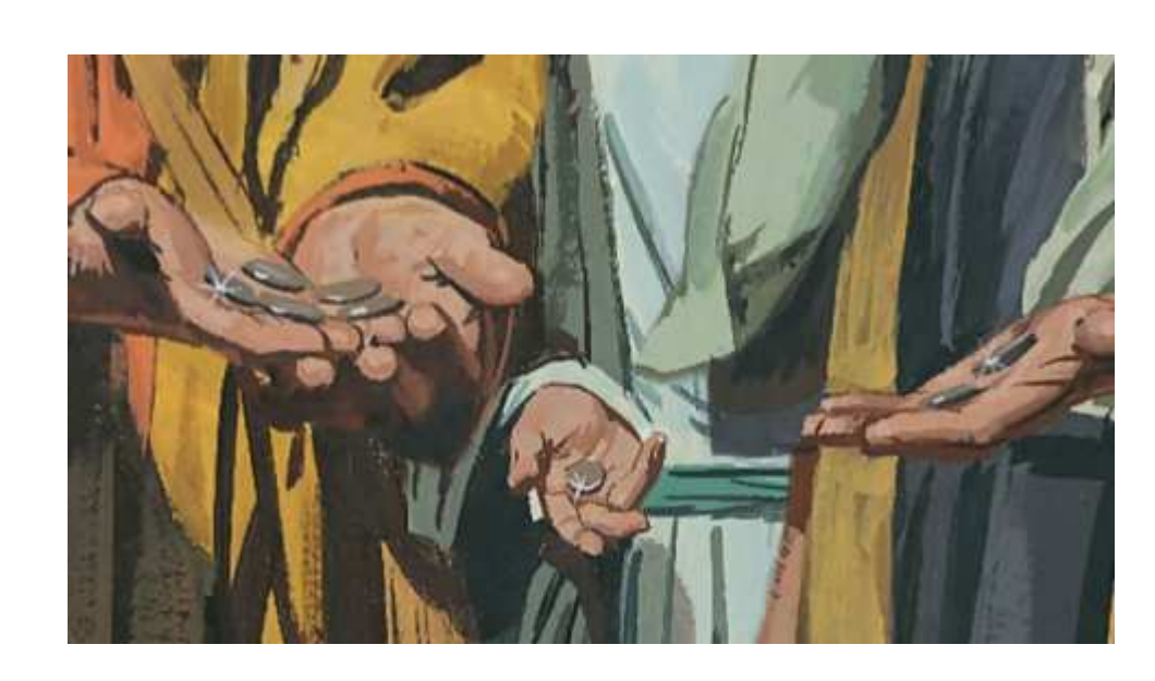
We are stewards