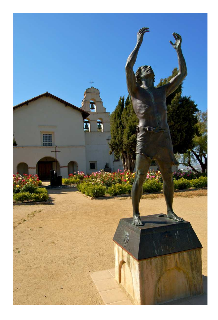
A call to repentance