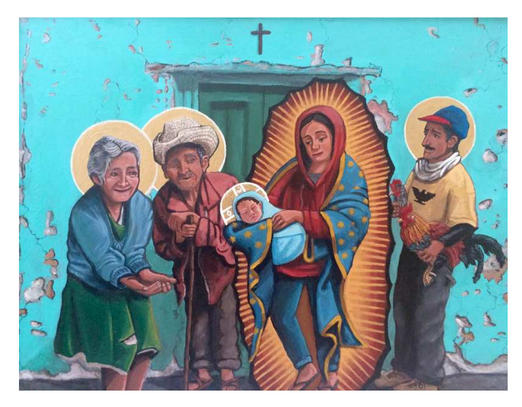
My eyes have seen your salvation