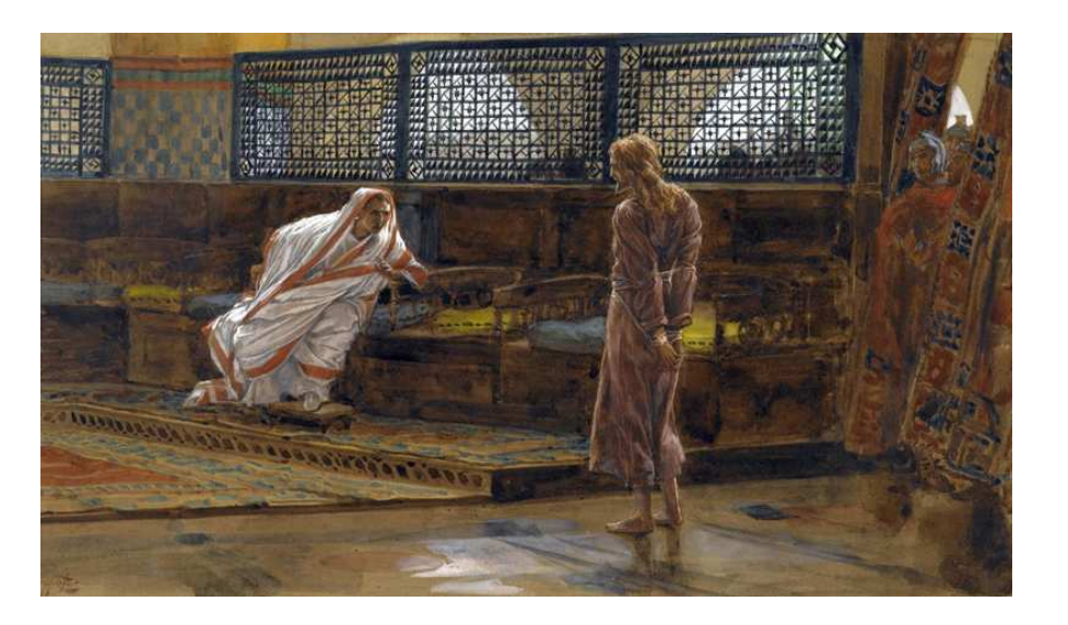
My kingdom is not of this world

Attribution: Tissot, James, 1836-1902. Jesus Before Pilate, First Interview, from Art in the Christian Tradition, a project of the Vanderbilt Divinity Library, Nashville, TN. <a href="https://diglib.library.vanderbilt.edu/act-imagelink.pl?RC=56679">https://diglib.library.vanderbilt.edu/act-imagelink.pl?RC=56679</a> [retrieved April 18, 2024]. Original source: https://commons.wikimedia.org/wiki/