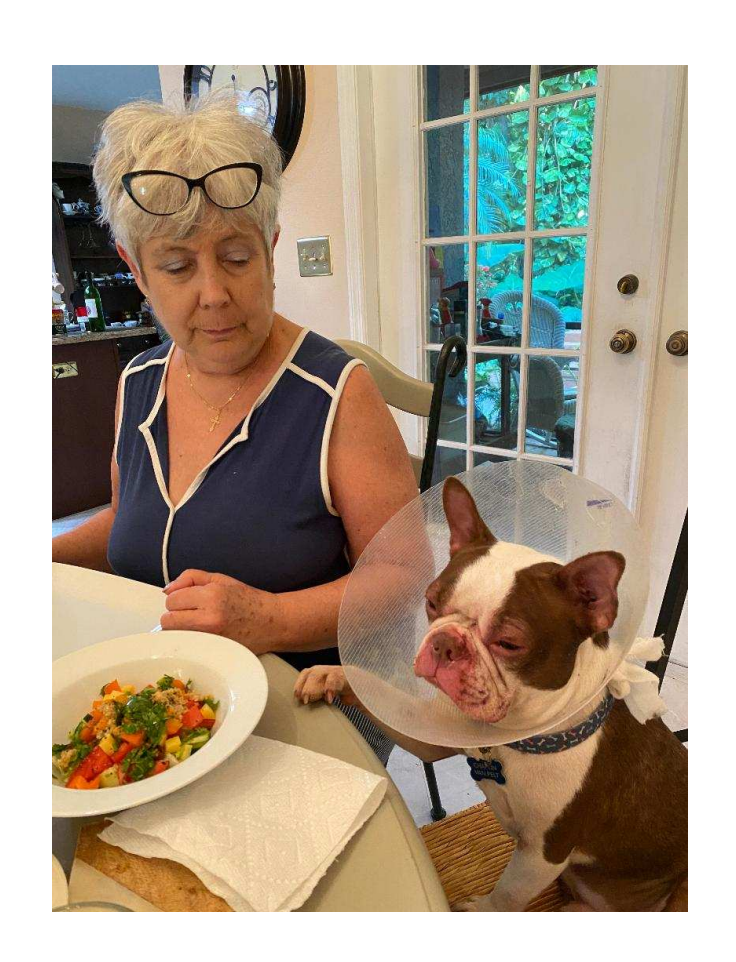
LOVE AND WRATH