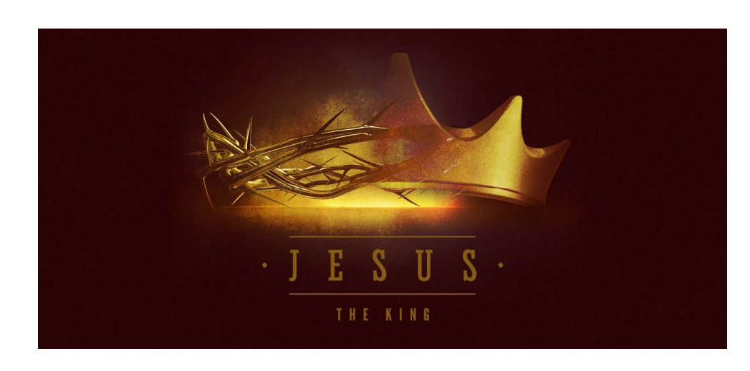
A different kind of king