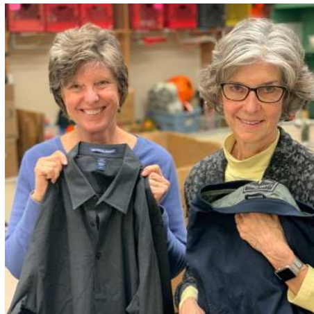
West Swampers work with other volunteers to price clothing and games at Care & Share in February. More pictures on page 5.