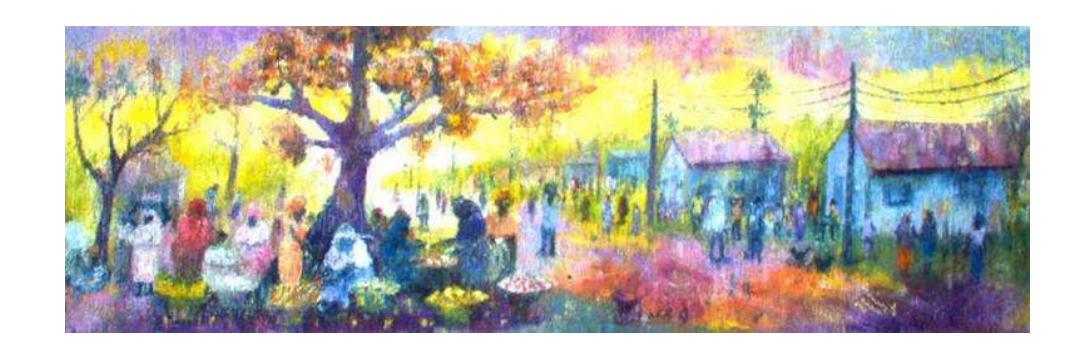
Where two or three are gathered

Cover art: Under the Tree , by Nigerian artist Ayibiowu Olusola David, 2003.