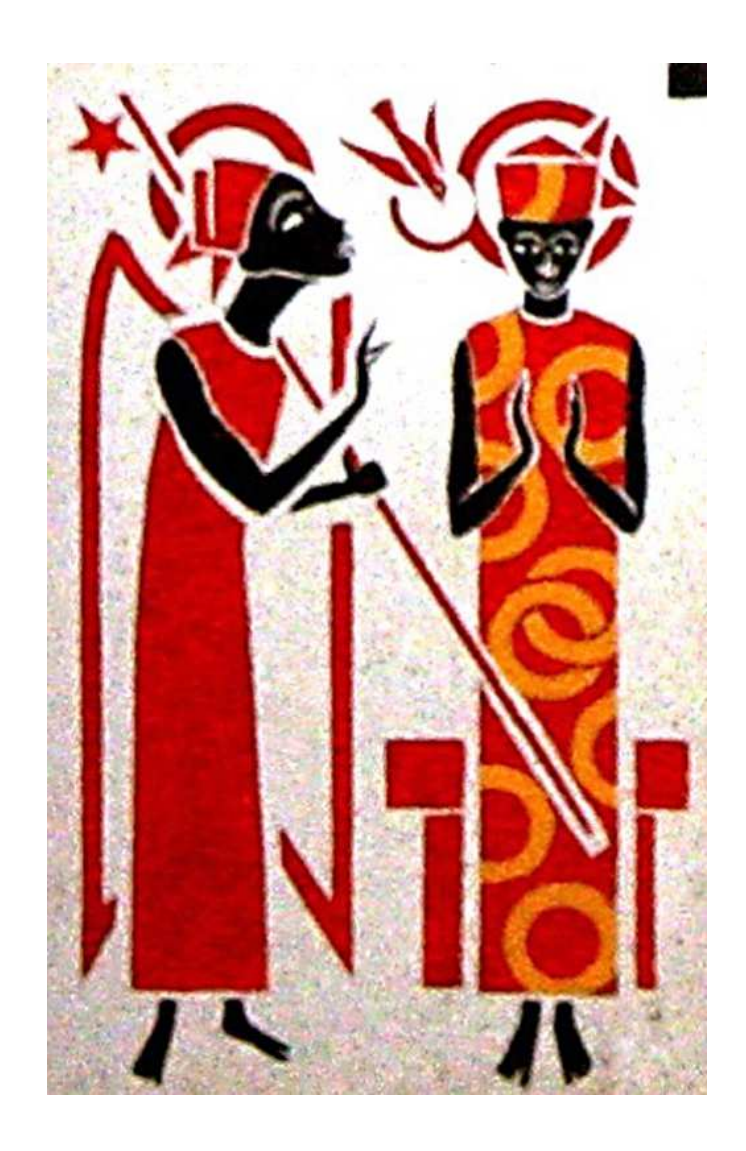
You shall bear a son