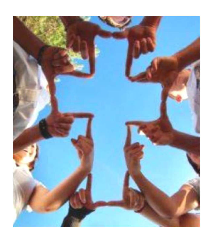
Our Mission: Discovering together How to follow Jesus