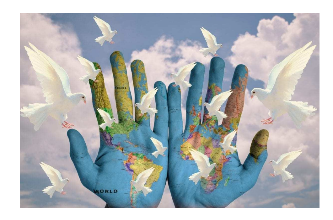
International Day of Peace

Cover art: The United Nations General Assembly (UNGA) first established the International Day of Peace in 1981; it was first observed in September 1982. The day is celebrated annually on Sept. 21. It is often marked by churches on the closest Sunday to that date; but can be celebrated any Sunday in September—or the year, for that matter. When should we NOT be celebrating and striving for peace?!