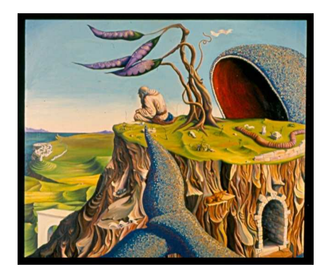
Jonah 4: Gracious and Compassionate