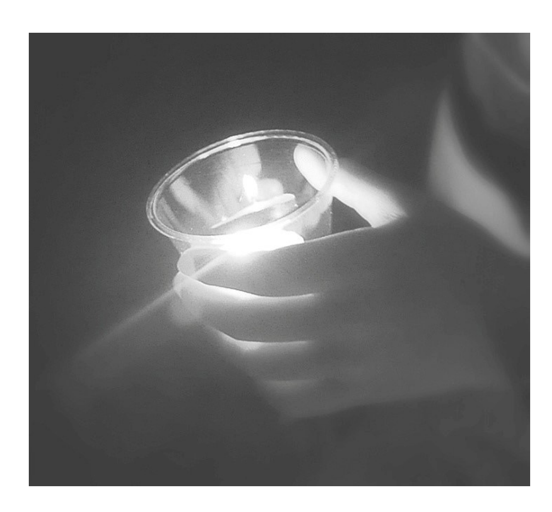
A time for return

Cover Art: Lumen Christi