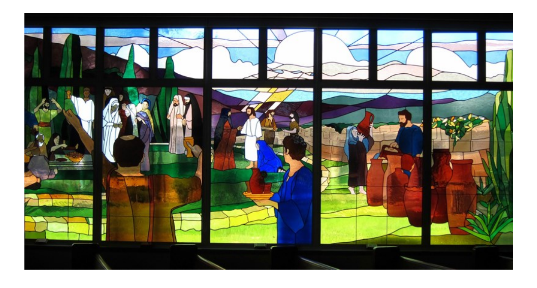
What kind of God brings the wine to the party?

Cover Art: Wedding at Cana, a stained glass piece (St John Neumann Catholic Church, Sunbury, OH) by Conrad Schmitt Studios, from Art in the Christian Tradition, a project of the Vanderbilt Divinity Library, Nashville, TN. https://diglib.library.vanderbilt.edu/act-imagelink.pl? RC=56770 [retrieved January 17, 2025]. Original source: https://commons.wikimedia.org/wiki/File:Saint_John_Neumann_Church_(Sunbury,_Ohio)_-_stained_glass,_the_Wedding_at_Cana.jpg.