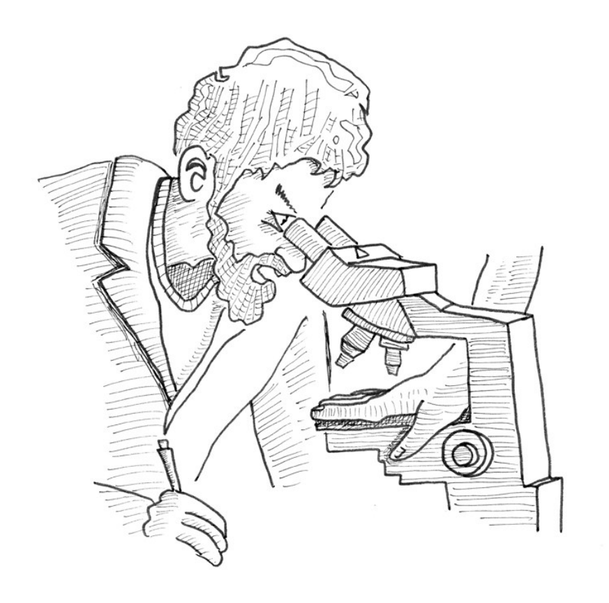
Witnesses to these things