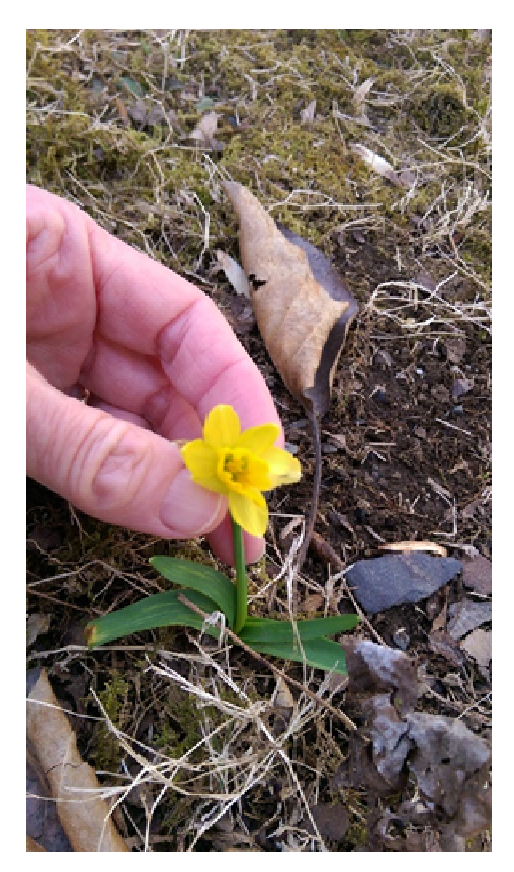
If you are filled with light, with no dark corners, then your whole life will be radiant, as though a floodlight was filling you with light." Luke 11: 36 (NLT)

I was at mother's a month ago checking out her yard. It was still winter and I had on my heavy coat and gloves as I walked around the house. There were bird feeders to fill, pansies trying to stay alive in her window boxes, and daffodils in bud trying hard to miss the frost.