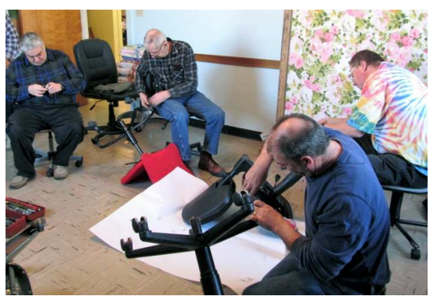
Members of the Men's Bible Study group remove thread from roller chair wheels.

raiser breakfast is Apr. 29 . This spring they will be benefiting the summer programs of Crossroads Community Center in Philadelphia. The Bible study group does a fine job, but if you would like to help out in some way, let them know; they need a break to eat themselves sometime.