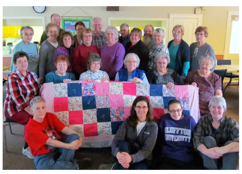
At 11:40 am on Saturday, the 300th comforter was finished. Showing it off are all the people who were present for this historic moment.

For more pictures and stats of the week, go to page 6.