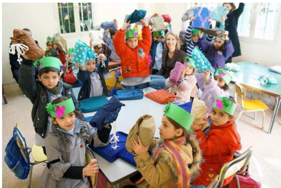
In December 2012, children from Syrian refugee families in Sidon Lebanon, receive MCC school kits and health kits and were told how volunteers in Canada and the U.S., including children, put together these kits.